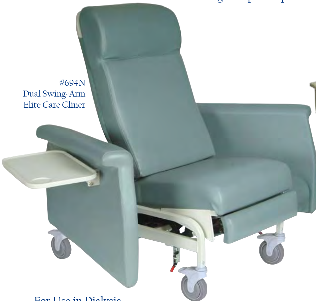
#694N Dual Swing-Arm Elite Care Cliner

Attention to detail and concern for comfort and quality - standards that Winco recliners are known for - place Winco Elite Care Cliners above the competition and among the best-selling chairs on the market today. Your Care Cliner now comes with LiquiCell®, an ultra-thin liquid-filled interface that aids in the process of preventing pressure sores without interfering with patient positioning or affecting stability.