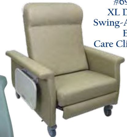
#695N XL Dual Swing-Arm Elite Care Cliner

For Use in Dialysis, Oncology, Acute Care, & Other Clinical Environments