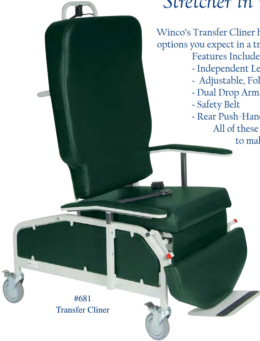
#681 Transfer Cliner

All of these features are combined to make our transfer cliner a perfect choice!