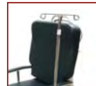
IV Option IV