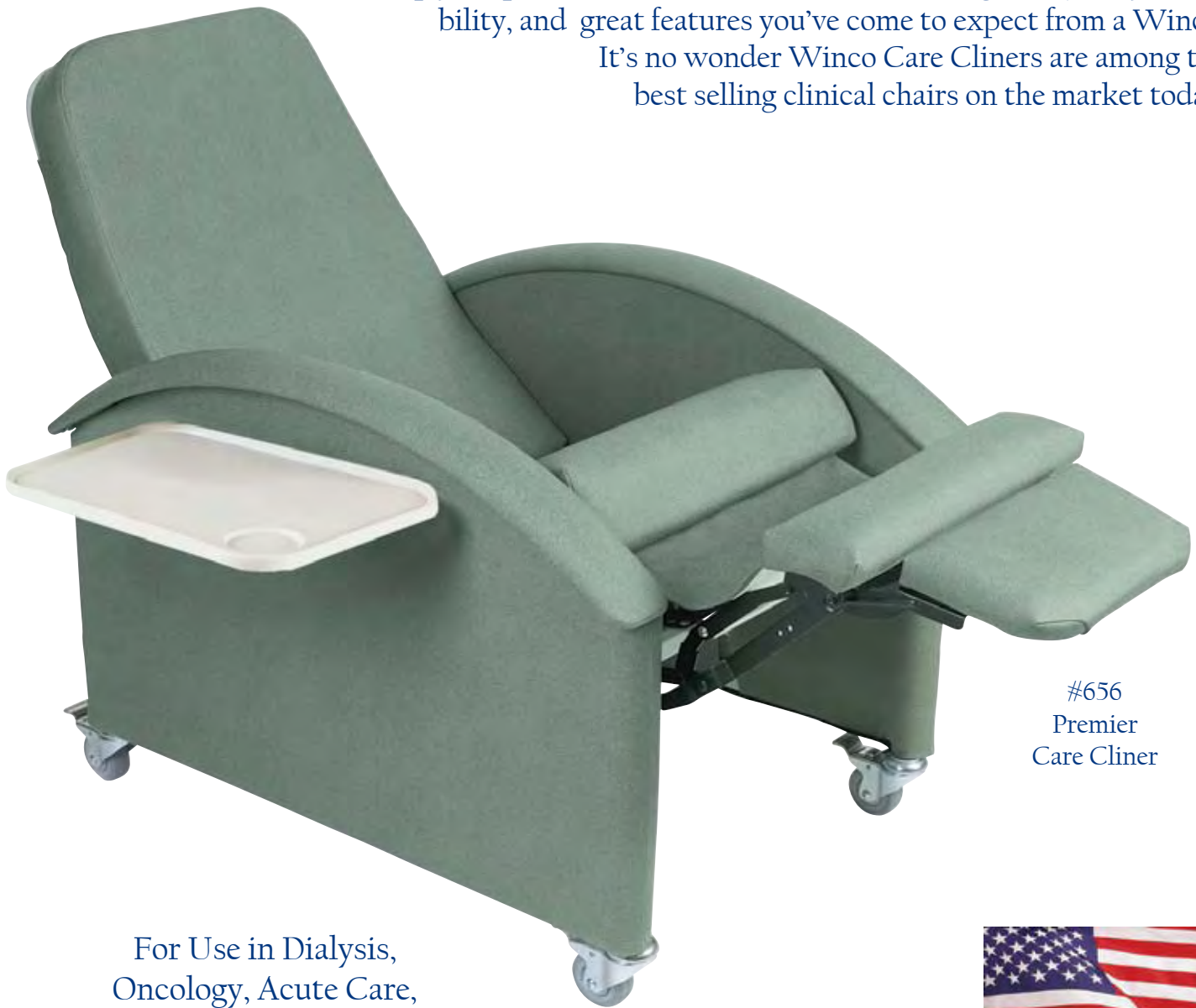
#656 Premier Care Cliner

It's no wonder Winco Care Cliners are among the best selling clinical chairs on the market today!