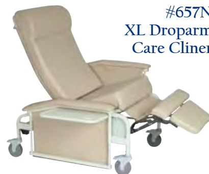
#657N XL Droparm Care Cliner