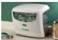
58014 KleenSpec Vaginal Specula Storage Dispenser