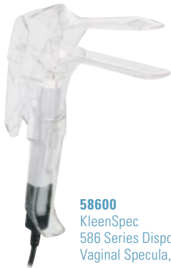
58600 KleenSpec 586 Series Disposable Vaginal Specula, Small

59006 KleenSpec 590 Series Disposable Vaginal Specula with Smoke Evacuator Tube, Medium (case of 48)