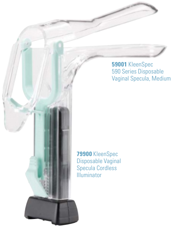
59001 KleenSpec 590 Series Disposable Vaginal Specula, Medium