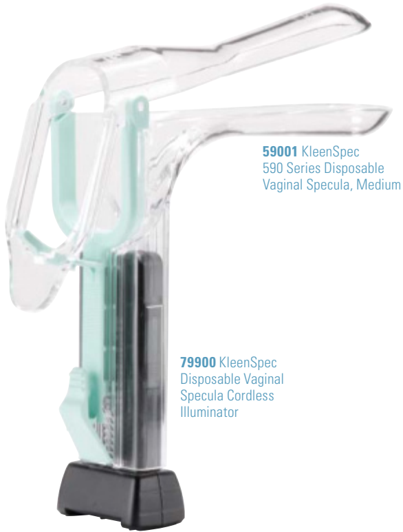
59001 KleenSpec 590 Series Disposable Vaginal Specula, Medium