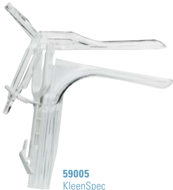
59005 KleenSpec 590 Series Disposable Vaginal Specula with Smoke Evacuator Tube, Small