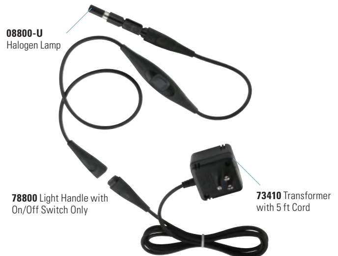
08800-U Halogen Lamp