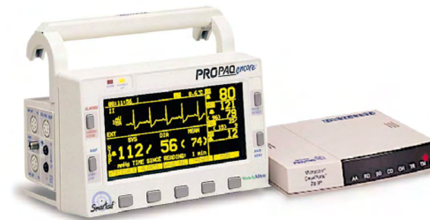
The Modem Propaq uses standard telephone lines to transmit vital signs data to the Acuity Central Monitoring Station. From any location, patients can benefit from in-hospital surveillance and expert clinical analysis.