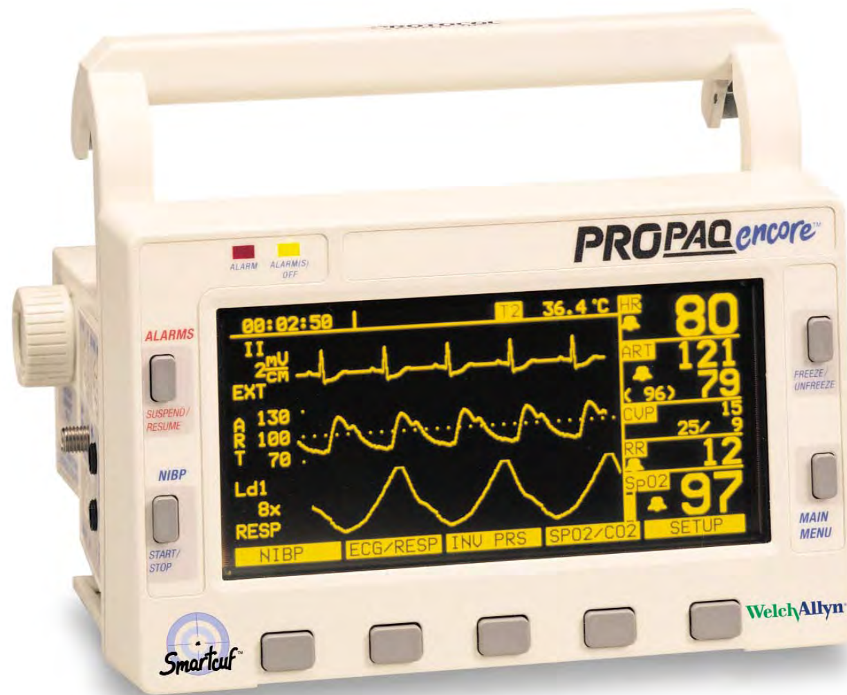
Propaq Encore allows you to bring the monitor to the patient, rather than move the patient to a fixed monitoring location.