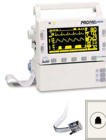
Connect a Propaq Encore to the Acuity Central Monitoring Station as easily as you would plug in a phone.