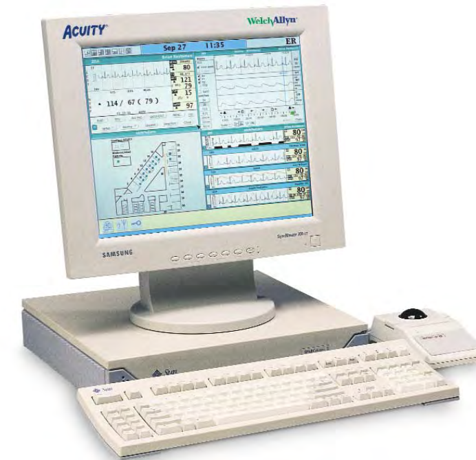
When you network your Propaq Encore monitors to the Acuity Central Monitoring Station, you'll see a map of your department, including up to 60 monitored patients, their status and location.