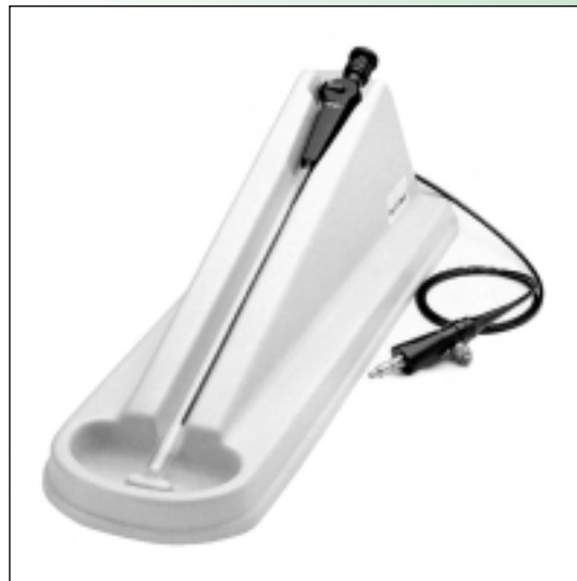
RL-150 Rhinolaryngoscope, shown with 65002 Disinfection Tray

*Offered only in U.S.A. and selected countries.