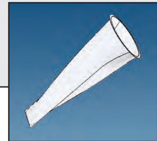
The filter media is tailored to fit inside every mouthpiece, providing an effective guard against cross-contamination.

The AstraGuard Filter is available as a kit with The Klip, our noseclip.