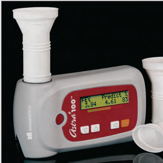
The AstraGuard Bacterial/Viral Filter is designed for all Astra Spirometers.

This easy-to-use disposable mouthpiece incorporates a highly efficient filter that virtually eliminates cross-contamination from patient to patient and from patient to health care professional.