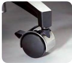
Classic and Value Series Locking Casters