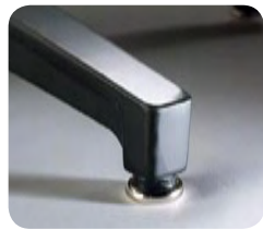
Classic Series Glides