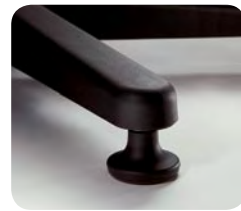
Value Series Glides