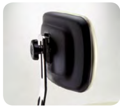
Classic and Value Series Backrest

Midmark is an ISO 9001 Certified Company.