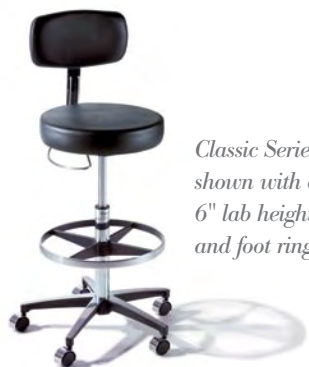
Classic Series 277 shown with optional 6" lab height extension and foot ring.