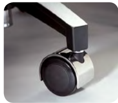
Classic Series Soft Rubber Casters