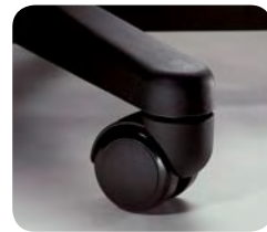
Value Series Soft Rubber Casters