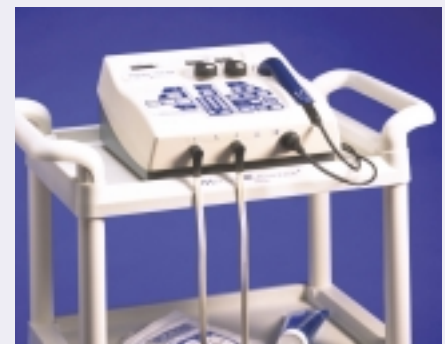
The economical model 73 cart includes 3 shelves to accommodate Mettler units and accessories.