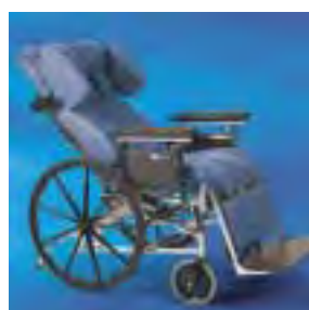
HTR 5500 in full recline position