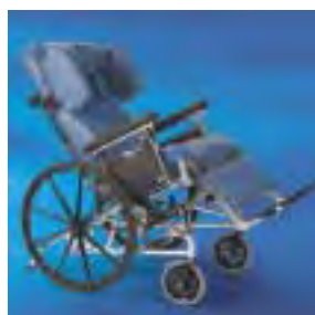
HTR 5500 in full tilt position