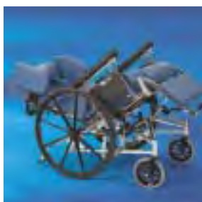
HTR 5500 in full tilt and recline position