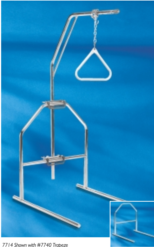
7714 Shown with #7740 Trapeze

Invacare trapeze units are an important patient room accessory designed to help patients change positions while in bed and to aid in transfer from bed to chair with minimum attendant assistance. Trapeze units have a wide range of height adjustments and handbar positions to maximize patient accessibility. The unit can be installed quickly and easily on an Invacare floor stand or on any Invacare home care bed end.