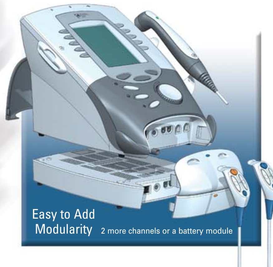
Easy to Add Modularity 2 more channels or a battery module

Attention to detail is logically designed in the user interface and continues into the new therapy system cart, providing an integrated cord management strategy to minimize the tangling of cords. Six concealed storage bins keep therapy resources such as gels, towels and electrodes close at hand.